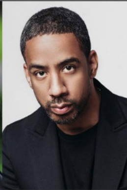
Ryan Leslie Founder & CEO, Superphone